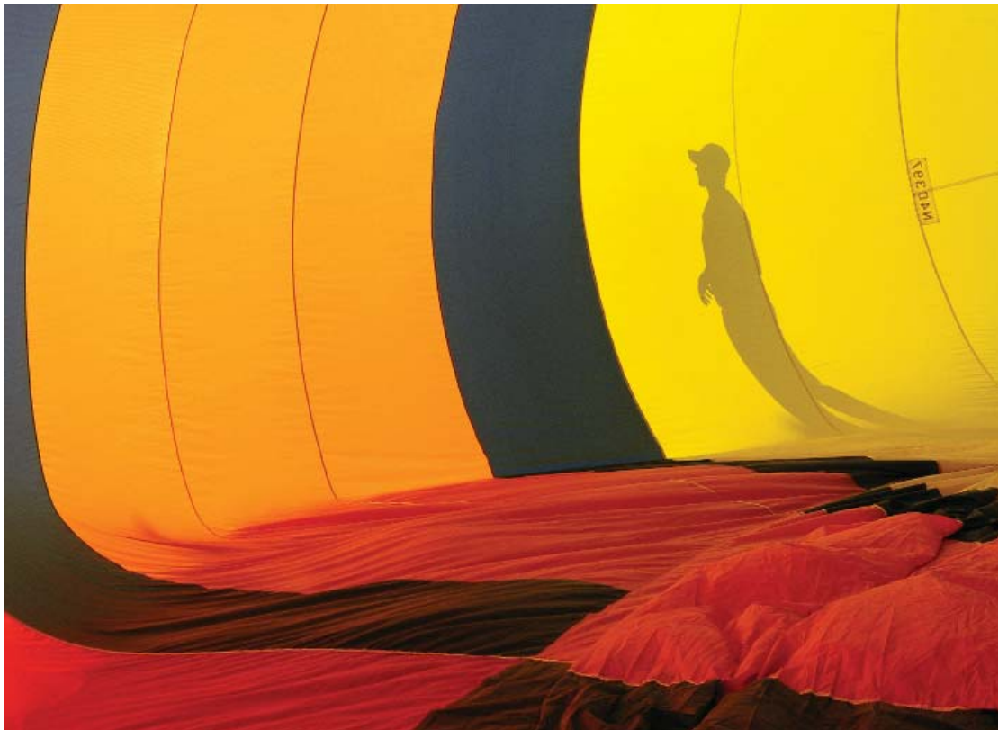
Blue Ribbon - Finalist, Balloon Crew Silhouette by Dave Brown.

Big Picture Digital Imaging Lab is located at 311 N. Downtown Mall, on the corner of Las Cruces and Main Street (575) 647-0508.