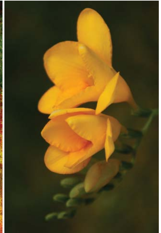
Blue Ribbon - Finalist, Flower 3 by Karen Siemsen