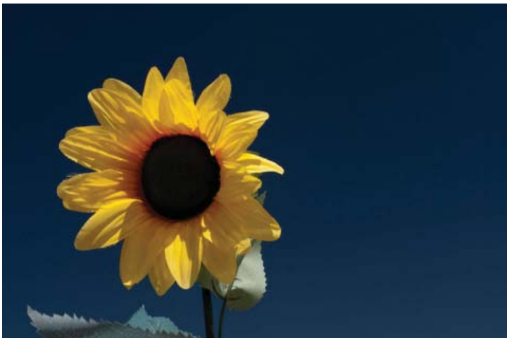
April Photo Theme "Blue & Yellow"

Why it's important: New Mexico's Otero Mesa is the largest and wildest Chihuahuan Desert grassland left on public lands in America. At over 1.2 million acres in size, the area is home to 1,000 native wildlife species, including mule deer, mountain lion, black-tailed prairie dogs, golden and bald eagles, over 200 species of migratory songbirds, and boasts the state's healthiest and only genetically pure herd of pronghorn antelope (which you will probably see.) About half is intact desert grasslands—one of the most endangered ecosystems in the US—which sits atop an untapped aquifer with enough water to serve 1 million people for 100 years. Proposed oil & gas development could